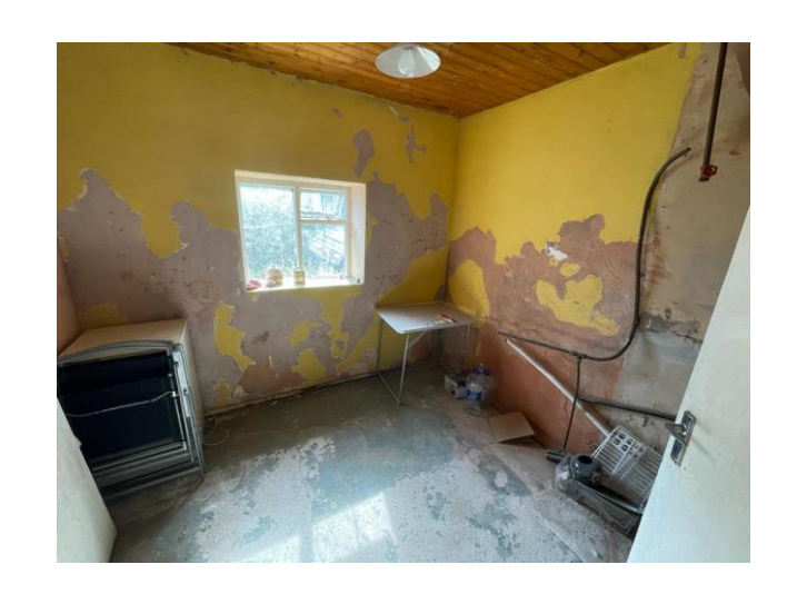
Bedroom 2: 3.0m x 2.9m