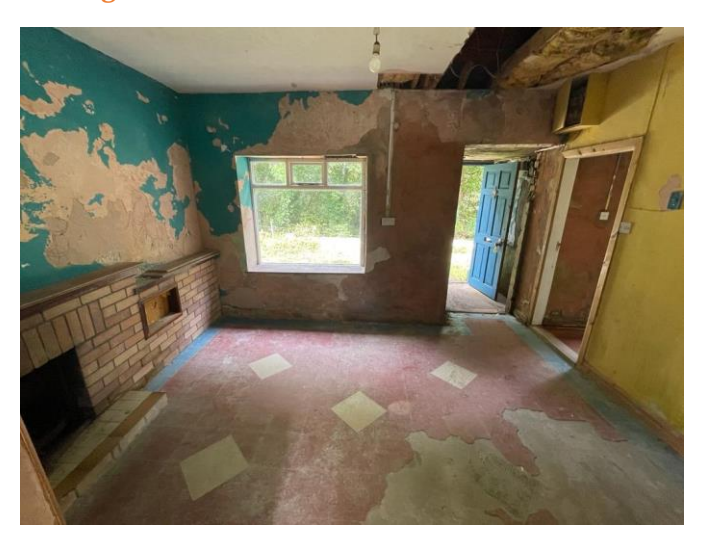
Bedroom 1: 3.0m x 2.9m