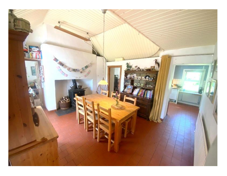
Kitchen: 3.2m x 3.5m

Bright and spacious dining area with quarry tiled. flooring and solid fuel stove.