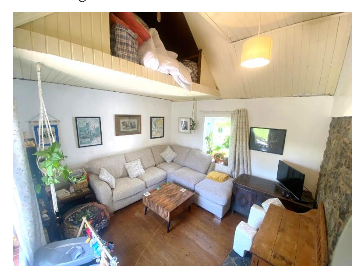
Bedroom 1: 3.5m x 2.8m

Bright and spacious sitting room with timber flooring and mezzanine.