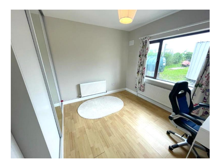
Bedroom 5: 2.4m x 2.5m Single bedroom with laminated flooring.

Double bedroom with built in wardrobe and laminated flooring.