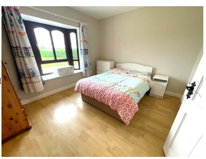
Bedroom 4: 1.8m x 3.3m Single bedroom with laminated flooring.